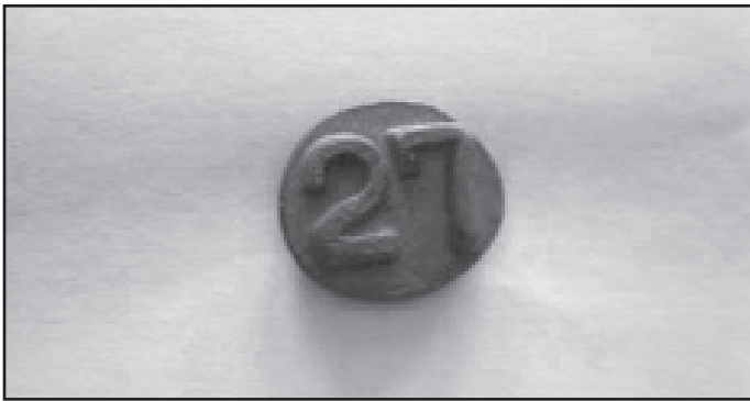
In this photo of a date nail, the number 27 is raised and would be from 1927.